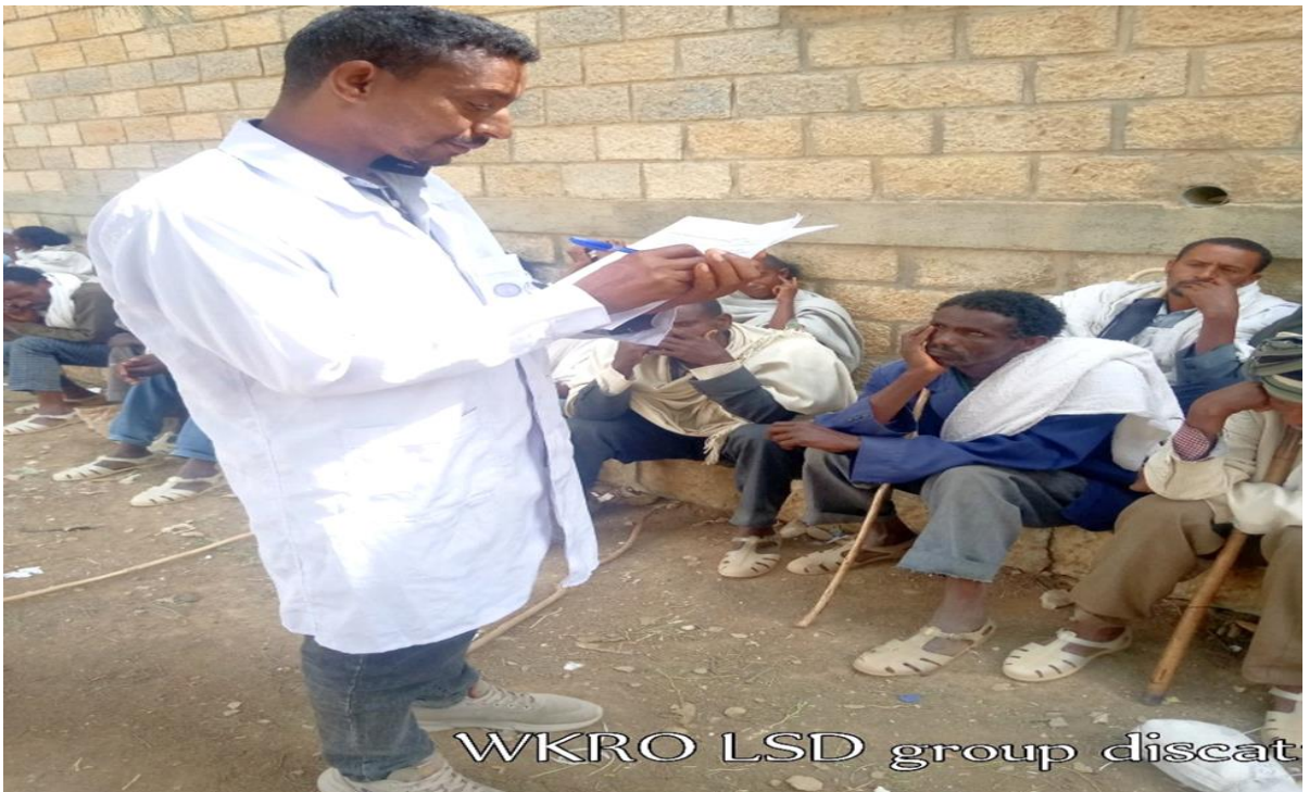
Figure 3 : Focus Group Discussion in Wukro