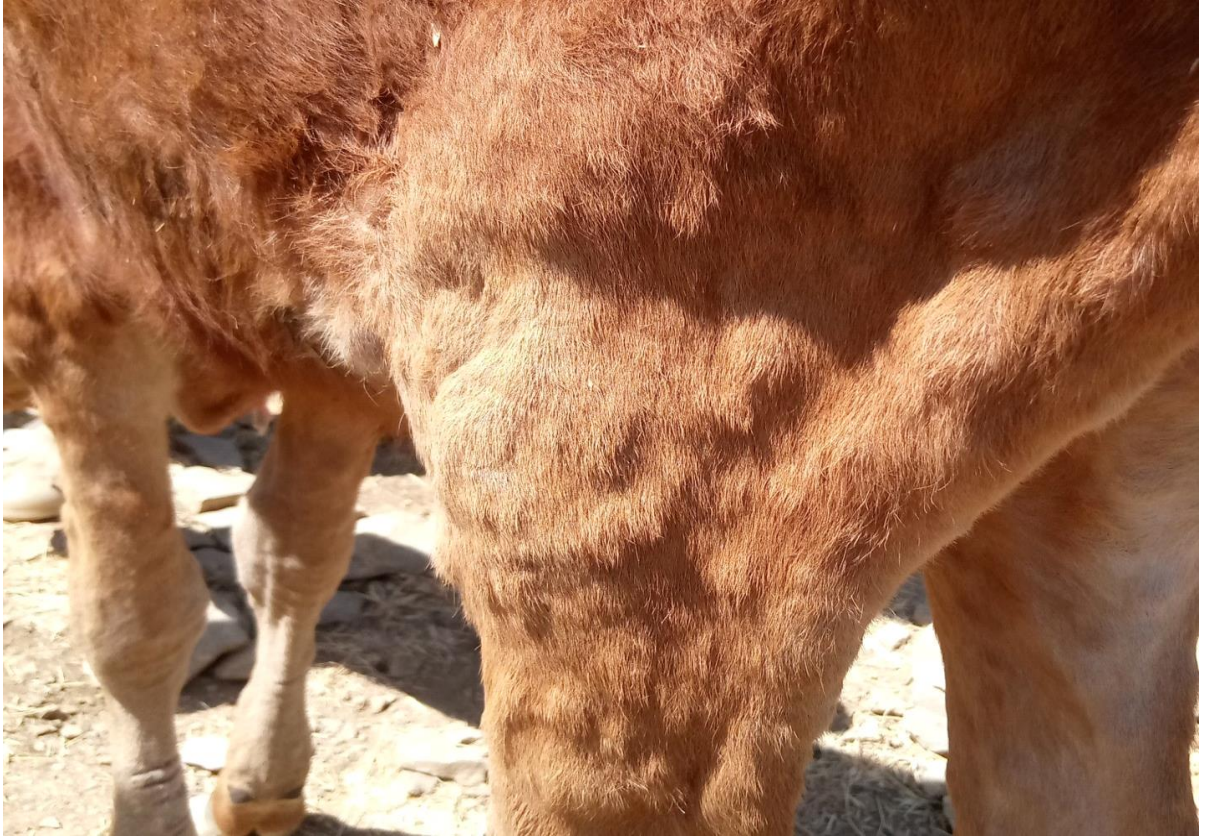
Figure 4: Clinical sign of LSD active case