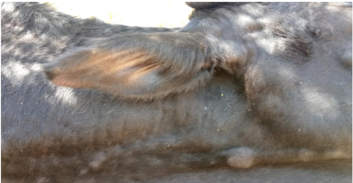
Figure 5: Clinical sign of LSD chronic case