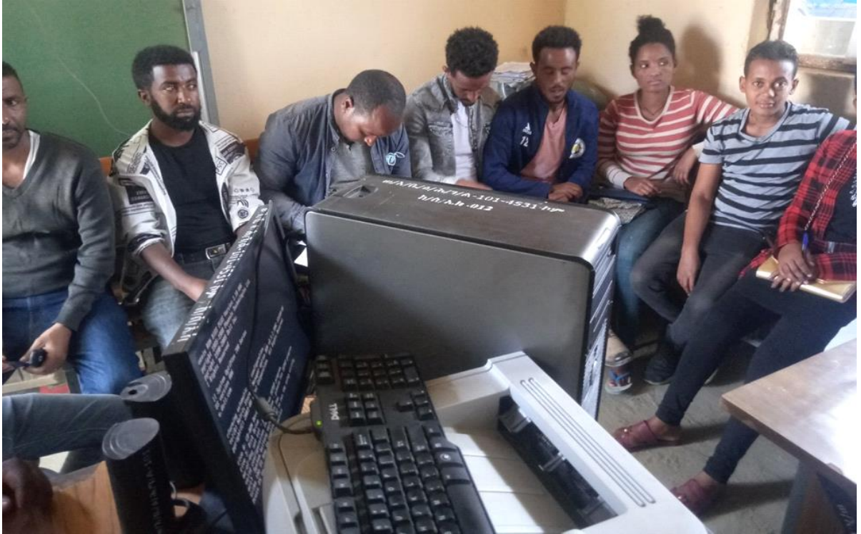
Figure 2: Focus Group Discussion in Enderta district